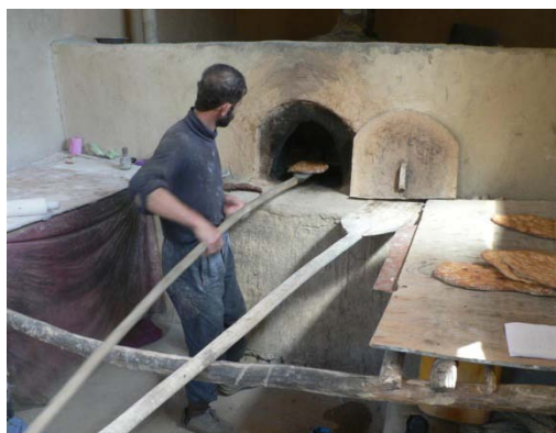
1. Dash ovens as used in community bakeries (a coal-fired energy-efficient oven; a low-cost option and therefore available in the Kahmard district).

Bakeries in cities sell baked bread at a relatively reasonable fee. Community bakeries in rural Afghanistan, however, receive dough from their customers and bake it for them. Bakeries operate three times a day: morning, noon and evening, therefore customers can eat fresh bread at every meal. In Afghanistan, two types of bakeries are common: