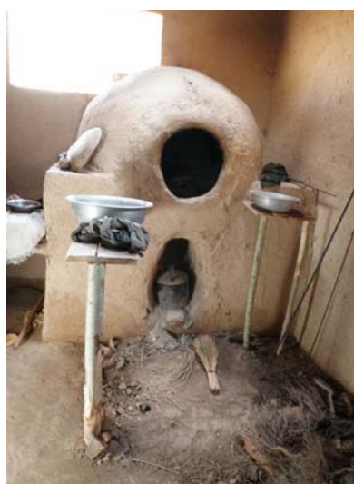
2. The tandoor is the traditional oven made of clay, fired by shrub, wood or gas and used in households.