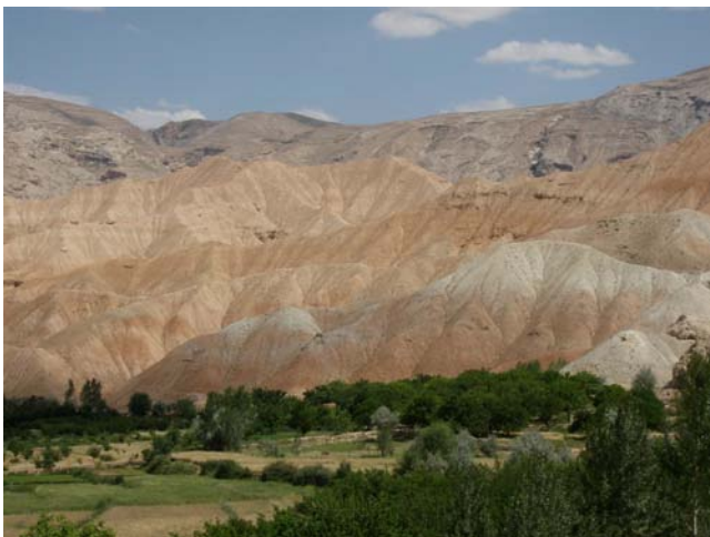
View of the bare hillsides of Kahmard district

Kahmard district is located at 1,475 meters above sea level. In this mountainous district, the livelihood of the predominantly rural population of about 8,000 families depends on very limited irrigated land at the bottom of the valley, where mainly wheat, potatoes and fodder crops are grown. Farming is mainly subsistence based and livestock is an important source of livelihood. Orchards and fruit production, especially apricots, almonds, apples and walnuts, are lucrative activities in the district. Because of the poor state of infrastructure preventing access to markets, the farmers are unable to get high returns from their produce. Another threat is the uncontrolled use of natural resources.