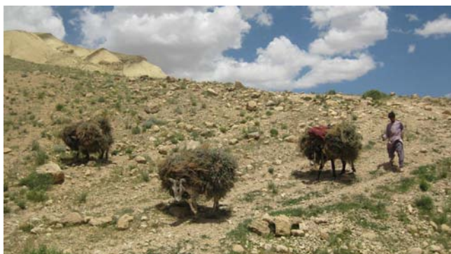
Donkeys carrying shrub to the villages

Since the establishment of community bakeries, shrub cutting has significantly declined in the villages as all families take their dough to the bakery. This has had a positive ecological impact on the watersheds and an economic impact on the families. One donkey load of shrub costs an average of 250 Afghani (about US$5), lasting for 2-3 days, whereas each family pays from 220 to 350 Afghani monthly to the baker. As a result, for the cost of one load of shrub a family gets its bread baked for the entire month including cookies and additional bread consumed, for instance, at wedding parties. Even though the bakeries started to function only in October 2009, their impact is positive and multi-fold.