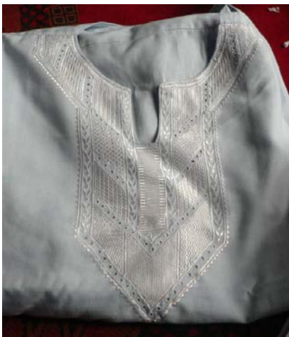
Handmade embroidery for selling on the local market

Community bakeries have brought many positive changes in the lives of 1,060 families living in 13 communities in Kahmard district. In addition to a steep 90% decline in shrub cutting, which has exerted a considerable positive impact on the local ecology, families are now able to save money and spend it on other purposes such as buying food, school supplies and household items. The bakeries have reduced the daily workload of women, men and children and improved the health of all family members; at the same time, women and men are able to spend time on more productive activities, such as vegetable gardens, artisan work and others. Women now have time to attend literacy classes and skills development courses, which would not have been possible before.