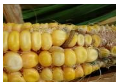
Damage by Asian corn borer larvae