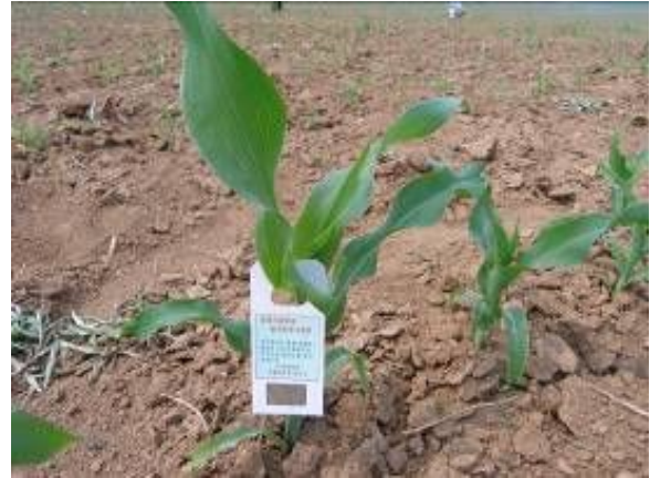
Maize plant with egg card

Each facility has a production team consisting of a manager, a technician and workers (6 staff per facility). To ensure sustainable management of each facility, a business plan was developed to specify the organisational structure, terms of references, calculations of annual inputs and outputs, costs of machinery maintenance and depreciation, a products distribution plan, etc. Taking into consideration the situation in the DPRK, the key feature of this plan is a barter system, which allows various essential inputs including barley and cole for the mass production of the parasitic wasp to be obtained.