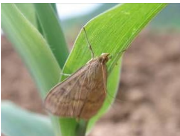
Asian corn borer

Biological control was seen as a highly promising option for attaining long-term suppression of the Asian corn borer in the DPRK. Constituting a fundamental component of IPM, this strategy involves using natural enemies to reduce pests. Natural enemies include predators (which eat the pest), parasitoids (which develop on or in the pest and ultimately kill it) and pathogens (which inflict disease that kills the pest). Biological control is a process of augmenting the natural enemies of a pest, either by providing food or hiding places, or by releasing large numbers of a specific natural enemy in a pesticide-like application.