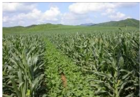
Intercropping maize – bean

Further expansion of the approach will enhance food availability in the DPRK, thereby contributing to improved national food security.