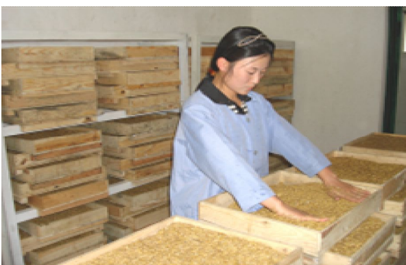
Production staff and equipment

Three experimental Trichogramma production facilities were established using Chinese designs and equipment, which were subsequently adapted to local DPRK conditions for the construction of a fourth facility. This pilot facility addressed problems associated with poor infrastructure and limited access to electricity. It incorporated locally-acquired equipment and permitted a reduction in electricity consumption by two-thirds. Following testing of the pilot facility, an additional four facilities were built according to the 'local design'. Strict quality control, in accordance with international recommendations, was also implemented to ensure production of high quality Trichogramma wasps.