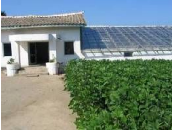
Trichogramma production facility

With an effective production method for Trichogramma in place, additional facilities were needed to supply more cooperative farms with this beneficial insect.