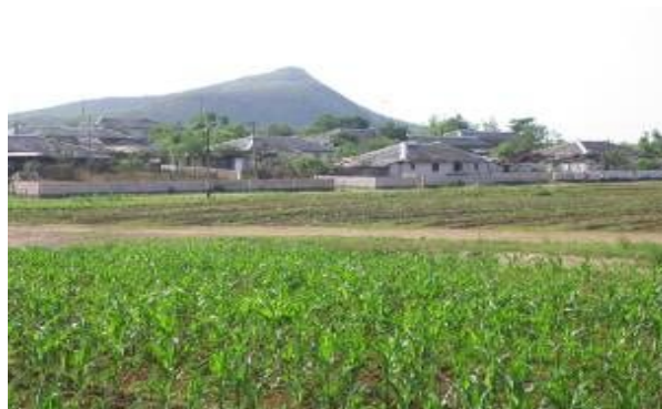
Maize cultivation on a Cooperative Farm

IPM is a pest management strategy that focuses on sustainable crop production by applying a combination of biological, cultural and chemical control measures. It gives precedence to non-chemical pest control measures, but employs the most environmentally friendly pesticides when required. The key element of this IPM approach in the DPRK is the mass release of Trichogramma , a parasitic wasp that protects the crop from a major insect pest, the Asian corn borer. Positive effects of reduced pesticide use is a marked decrease in farmer or consumer health hazards and negative environmental impacts.